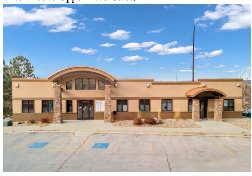
Enterance to Lower Level Suite, #2 (left)